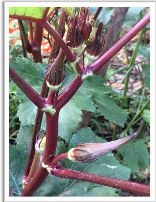
Right: Burgundy okra used as inspiration for Weaving Your Story.