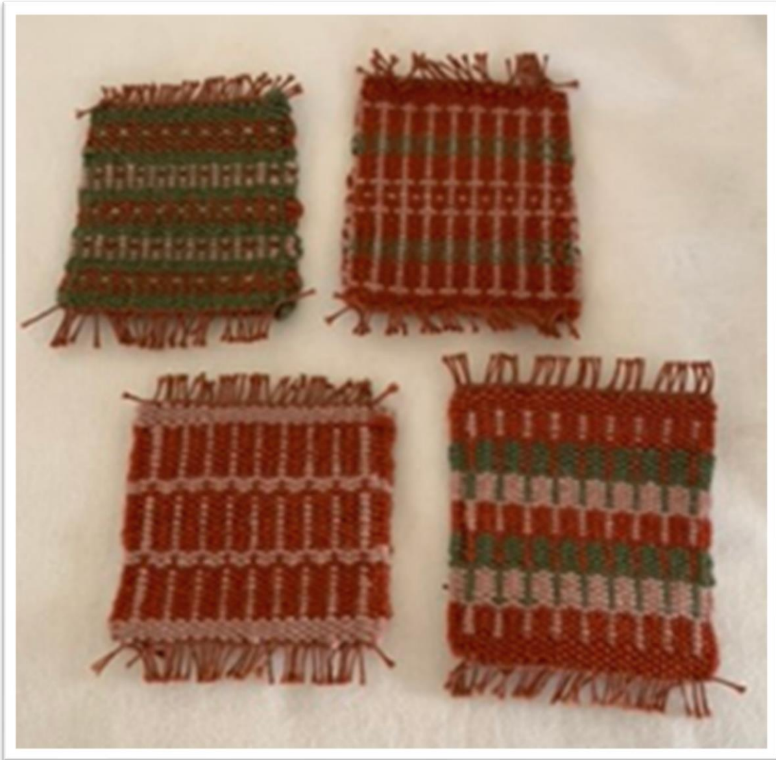
Kathy Perito wove these Krokbragd (3-shaft weave) mug rugs on a rigid heddle loom.