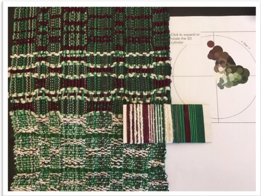
Above: Samples, yarn wrap, and color analysis for Weaving Your Story.

Wash your hands and keep spinning and weaving, Beth